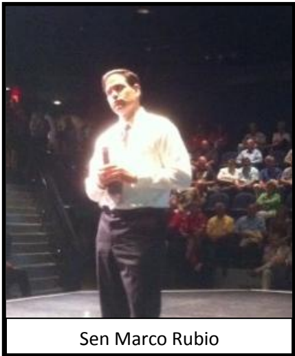
Sen Marco Rubio

SENATOR MARCO RUBIO ADDRESSES 200 + AT NEWS JOURNAL CENTER – on April 26, Sen Rubio told of dire consequences of increased debt for the US. He also stated that Medicare will be bankrupt in 9 years unless action is taken. He stated that while the US economy is the largest in the world (3 times the size of the China), it is not growing, it is still economy but our debt load is reaching dangerous levels. In fact, our debt is growing faster than economy and if we continue our current path (spending $1 trillion a year more than we take in) debt will reach $22-$24 trillion. Just as critical is that Medicare will go bankrupt in 9 years if we don’t address it.