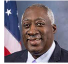
REP. WEBSTER BARNABY