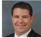
SEN. TRAVIS HUTSON