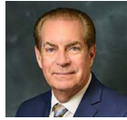
SEN. TOM WRIGHT