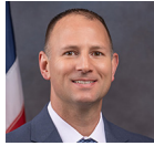
REP. CHASE TRAMONT