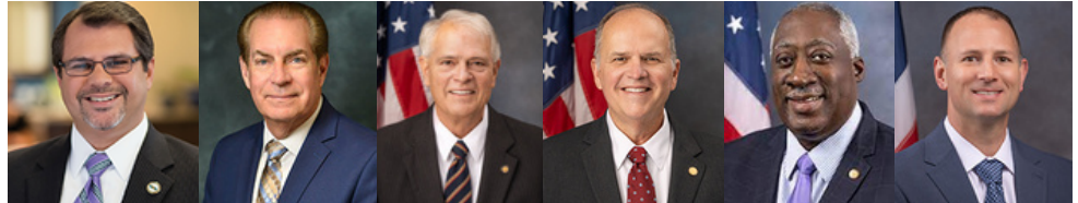
Senator Tom Leek