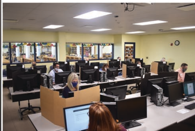
Daytona Regiona Chamber leadership takes YouScience assessment

This monthly publication is produced by the Daytona Regional Chamber of Commerce DaytonaChamber.com info@daytonachamber.com O. 386.255.0981