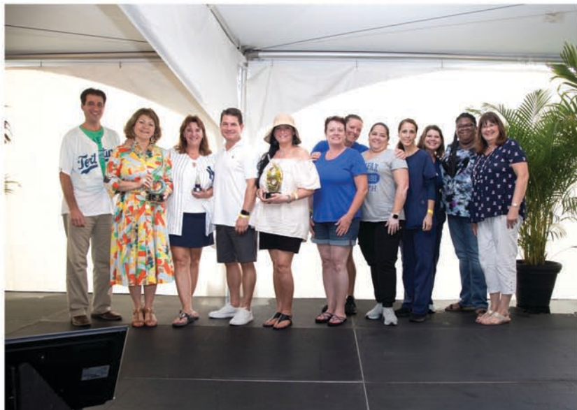
101st Daytona Regional Chamber Annual Meeting Bash at the Ballpark Award winners