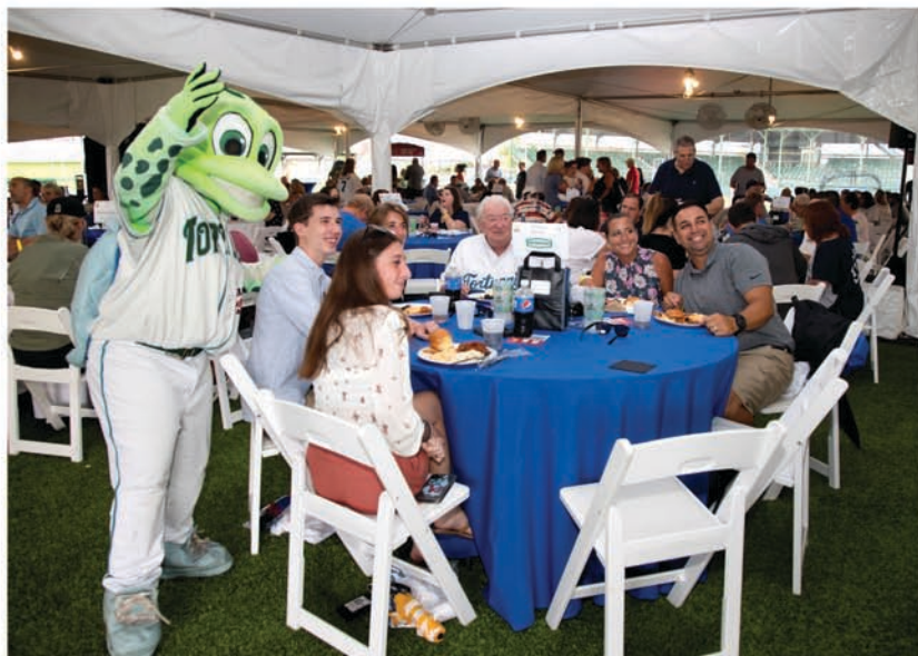
Sheldon the mascot with guests at the 101st Daytona Regional Chamber Annual Meeting Bash at the Ballpark

This monthly publication is produced by the Daytona Regional Chamber of Commerce DaytonaChamber.com info@daytonachamber.com O. 386.255.0981