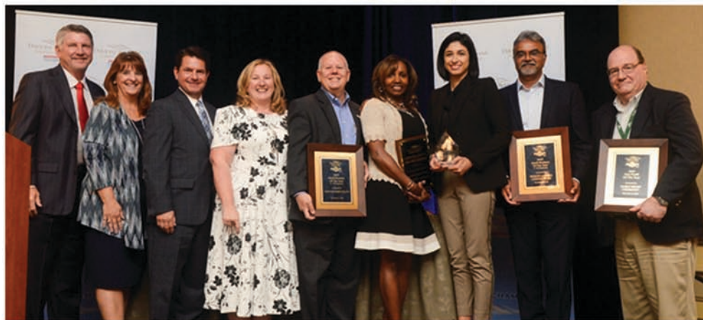
2020 Award Winners pose for a picture with Daytona Regional Chamber leadership