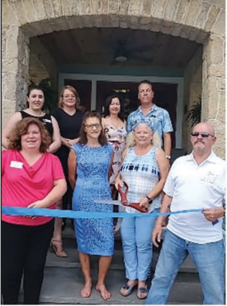
Congratulations to Ms. Maggie's South Country Inn Ribbon Cutting