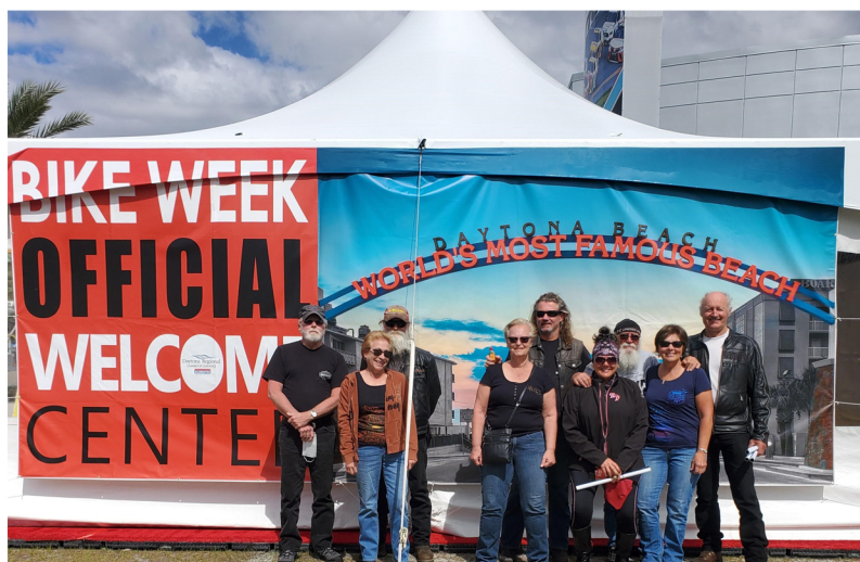
Visitors stand outside of the Bike Week Official Welcome Center