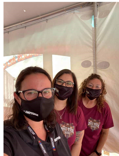
Volunteers pose inside the Official Bike Week Welcome Center

This monthly publication is produced by the Daytona Regional Chamber of Commerce DaytonaChamber.com info@daytonachamber.com O. 386.255.0981