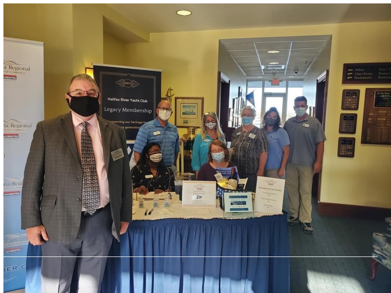
Members stand ready to make connections at Business After Hours