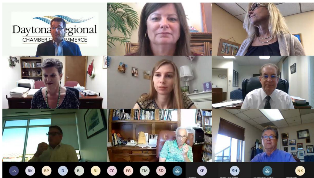
Senator Tom Wright speaks with attendees during Virtual Volusia Days at the Capitol.