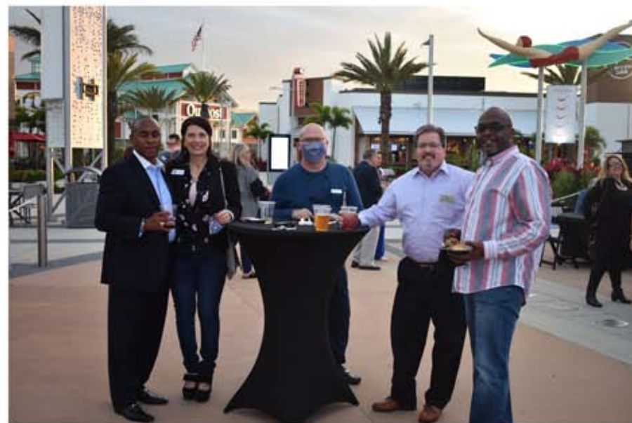
Daytona Regional Chamber members gather at a Business After Hours held at Victory Circle at One Daytona

This monthly publication is produced by the Daytona Regional Chamber of Commerce DaytonaChamber.com info@daytonachamber.com O. 386.255.0981