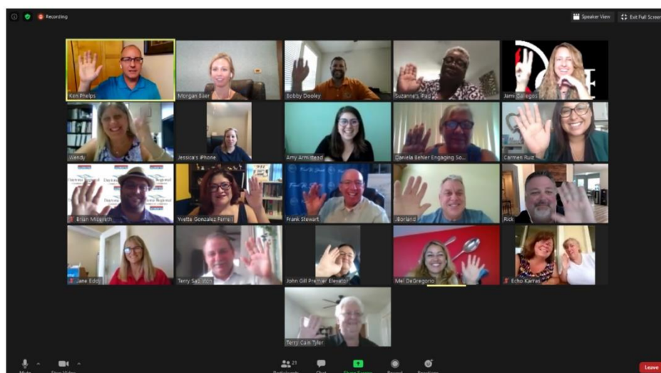
New Business Opportunities Uncovered During Let's Connect Virtual Networking