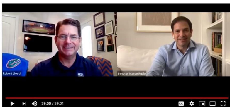
DAYTONA BEACH Town Hall Meeting with U.S. Senator Marco Rubio Unlisted