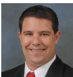
Sen. Travis Hutson