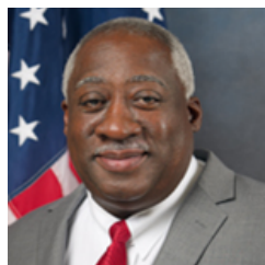
Rep. Webster Barnaby