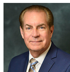
Sen. Tom Wright