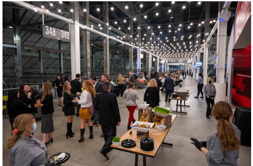
Food and Beverages Galore in the TriOval Club at 102nd Annual Meeting