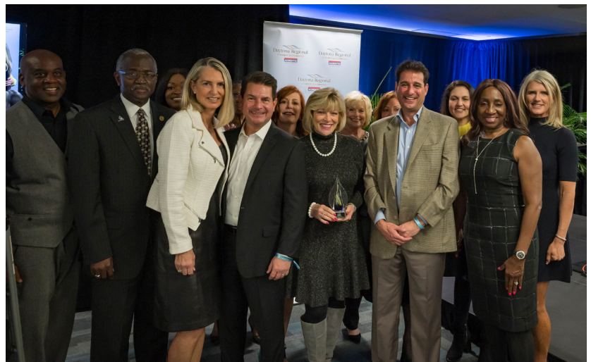
Members of the Dr. Mary McLeod Bethune Statuary Committee Receive Chairman's Award