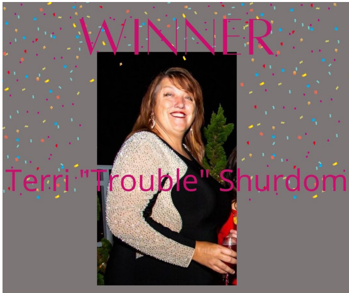
FEBRUARY 2022 DAYTONA REGIONAL CHAMBER AMBASSADOR OF THE MONTH