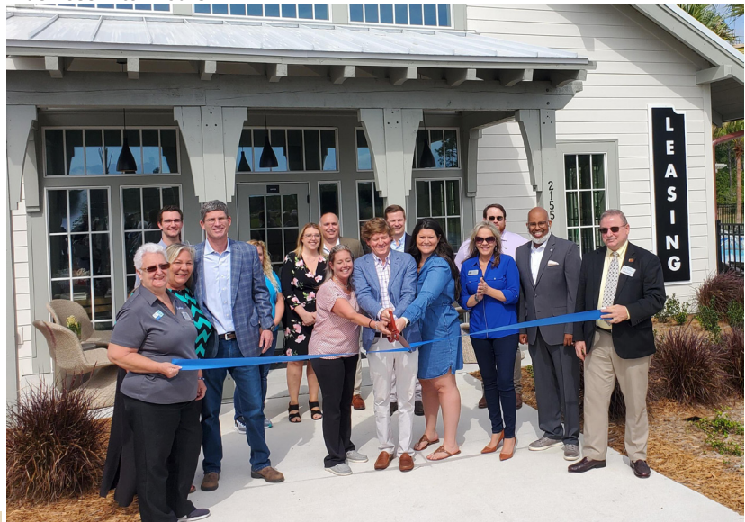
The Cottages at Daytona Beach Ribbon Cutting