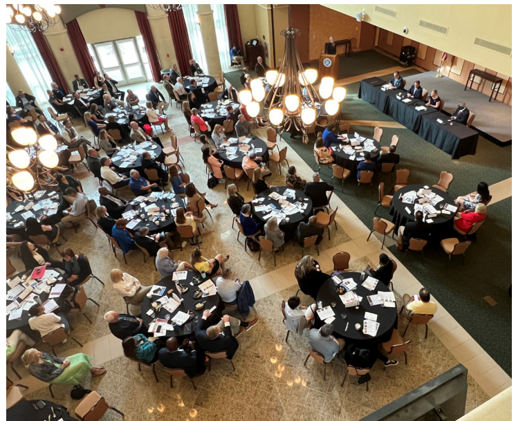
Birdseye view of April Eggs & Issues featuring the Legislative Delegation Welcome Back Breakfast