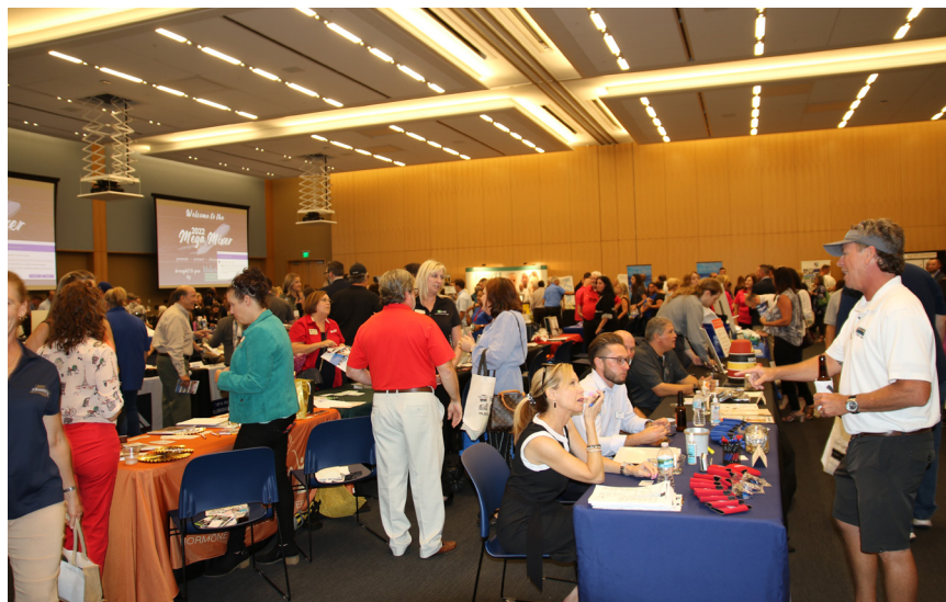
Mixing it up at the Volusia Chamber Alliance Mega Mixer