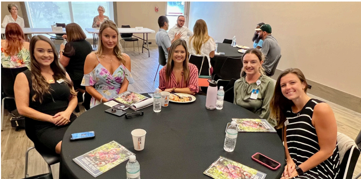
VYPG members at their June Lunch n Learn