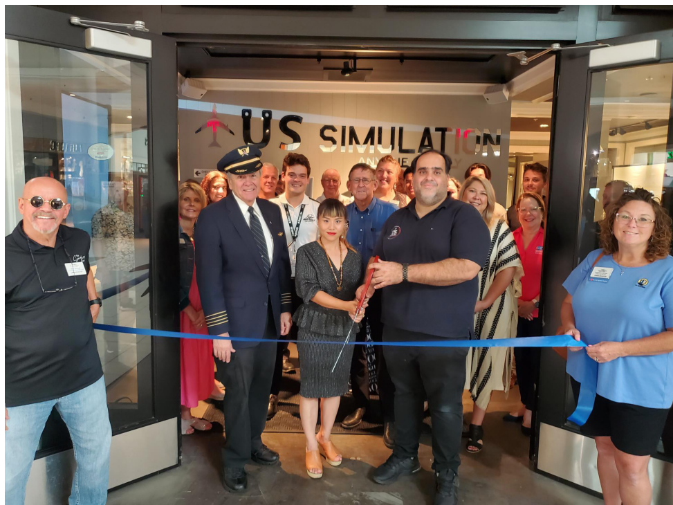
Ribbon Cutting at US Simulation in the Volusia Mall