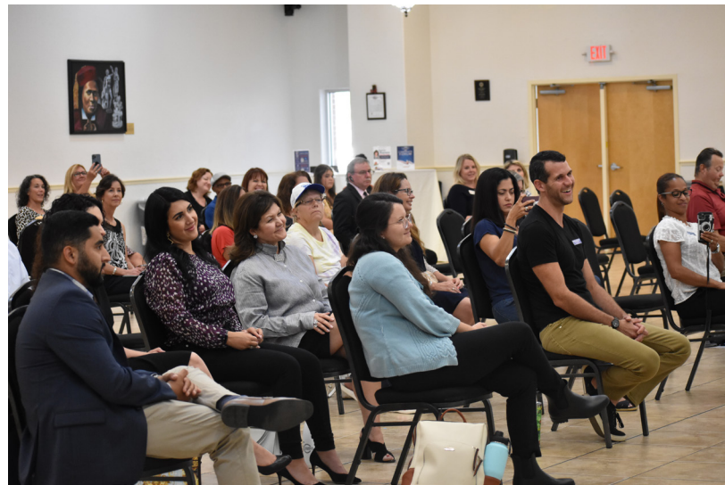
Attendees looking to be informed listen to speakers at the Volusia Public School Board Candidate Forum