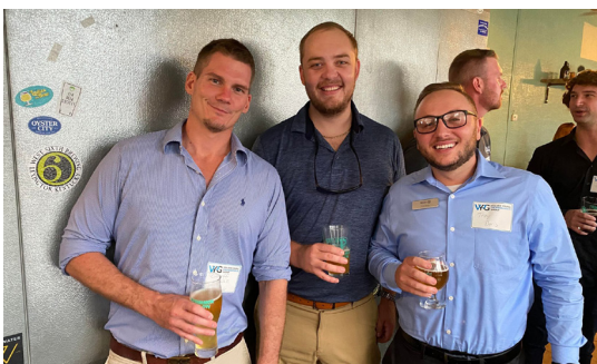
Members of VYPG enjoy each other's company while at their Social at Persimmon Hollow in Port Orange