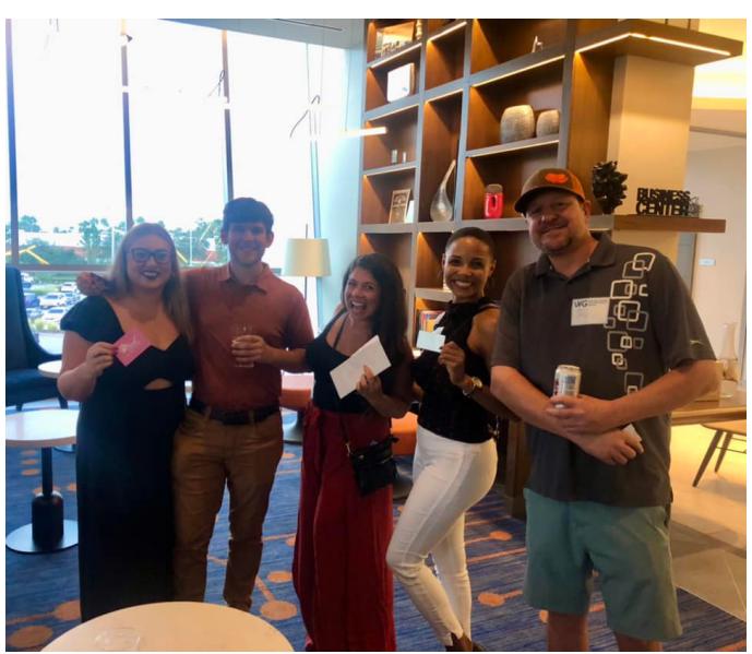
The winning scavenger hunt team at a Volusia Young Professionals Group event with their prizes donated by One Daytona