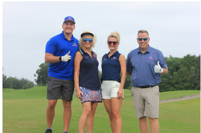
Team Realty Pros poses at the Business Links Golf Tournment at LPGA