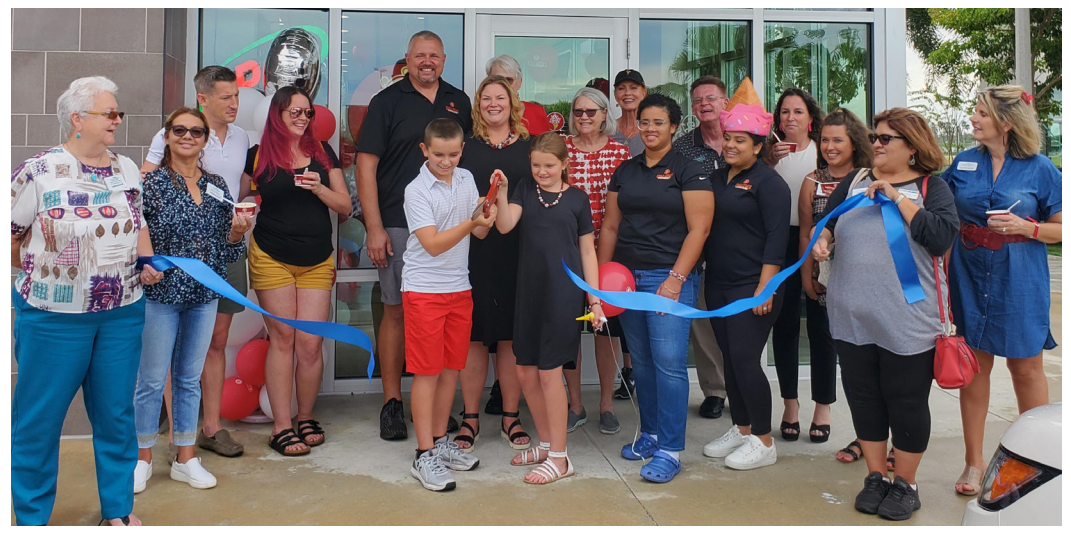
Cold Stone Creamery Ribbon Cutting