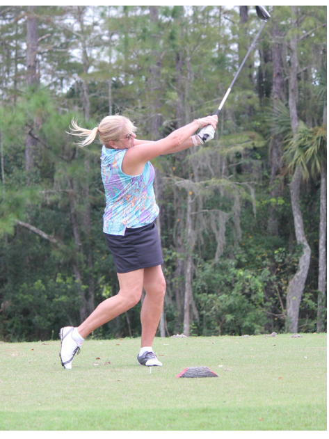
Powerful swing at the Business Links Golf Tournament