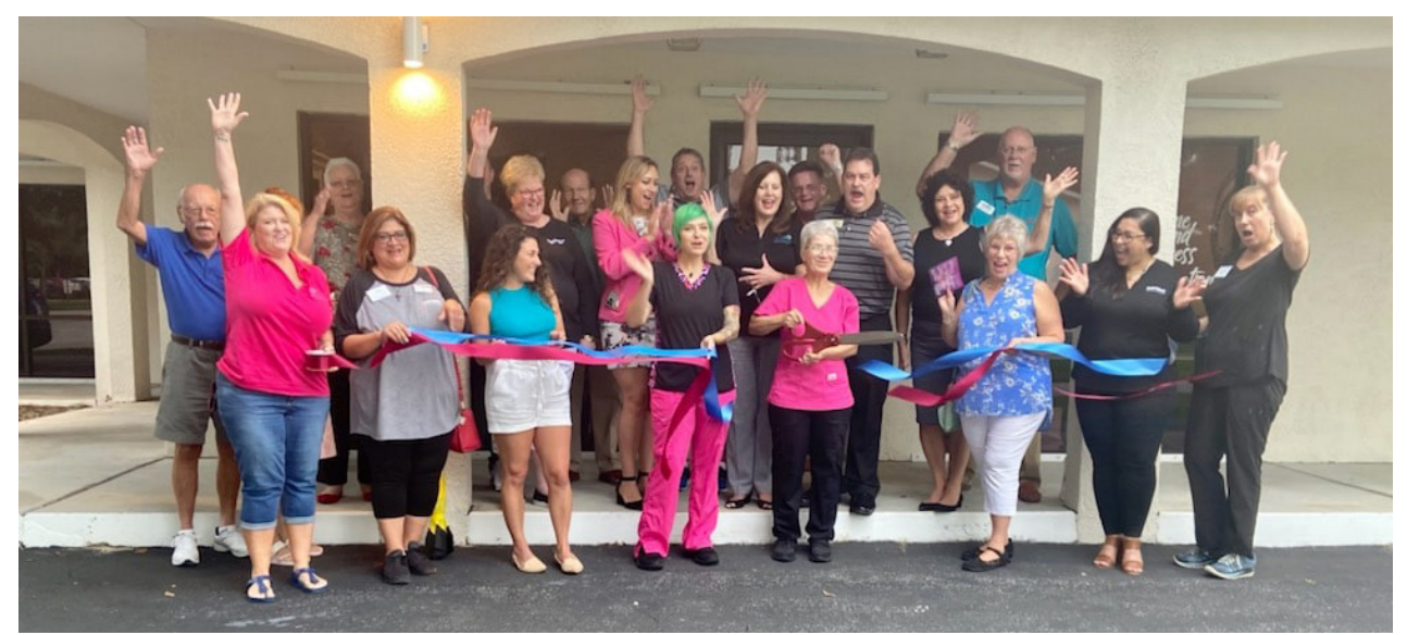
Pink Lotus Joint Ribbon Cutting