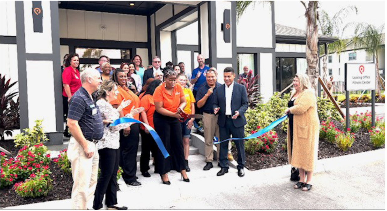
Pointe Grand Apartment Homes Ribbon Cutting