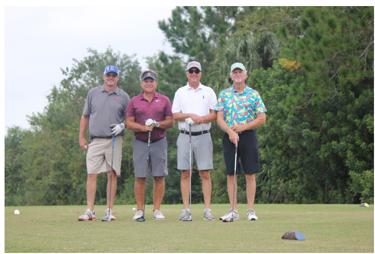
Golfers filled the field at the Business Links Golf Tournament at LPGA