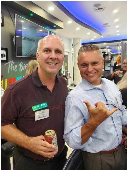
Business After Hours at Streamline Hotel