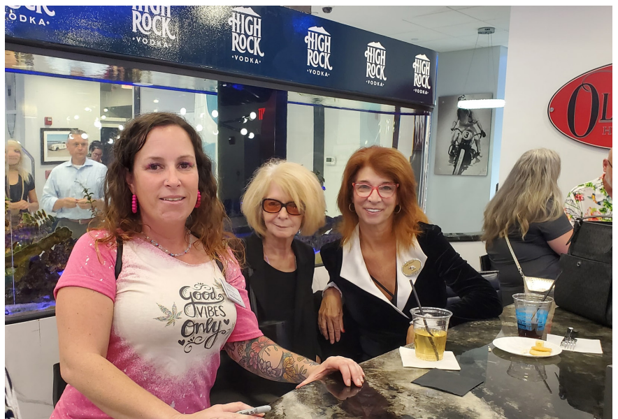
Business After Hours at Streamline Hotel