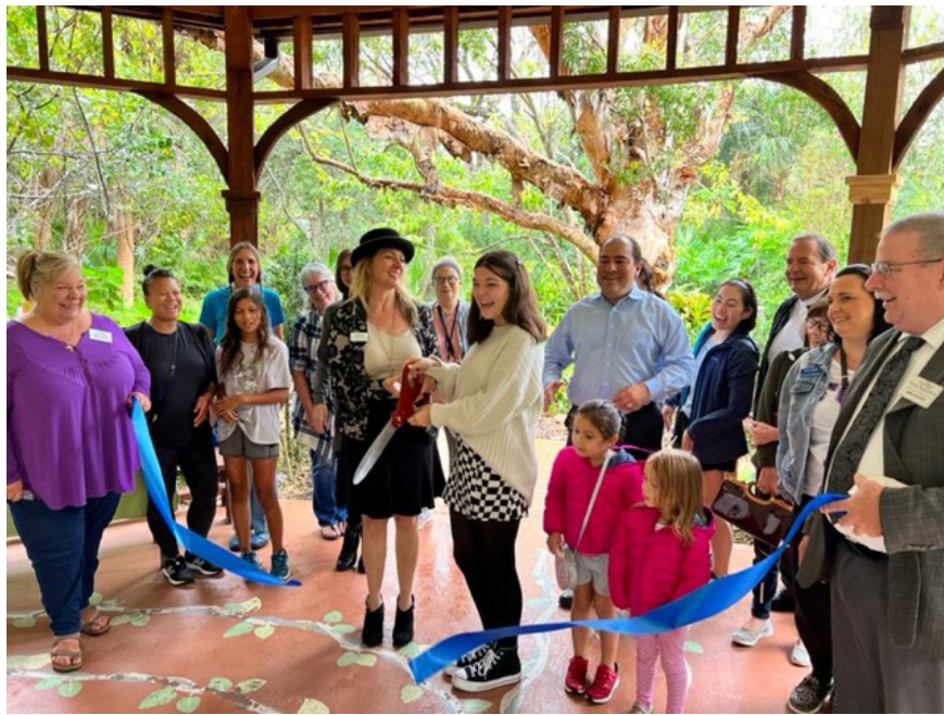
Little Art Gallery Ribbon Cutting