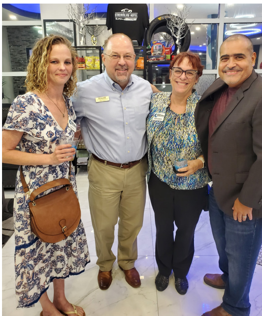
Business After Hours at Streamline Hotel