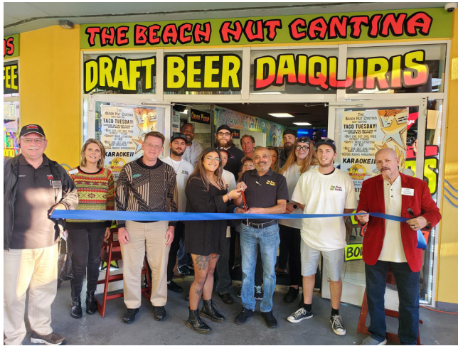
Beach Hut Cantina Ribbon Cutting