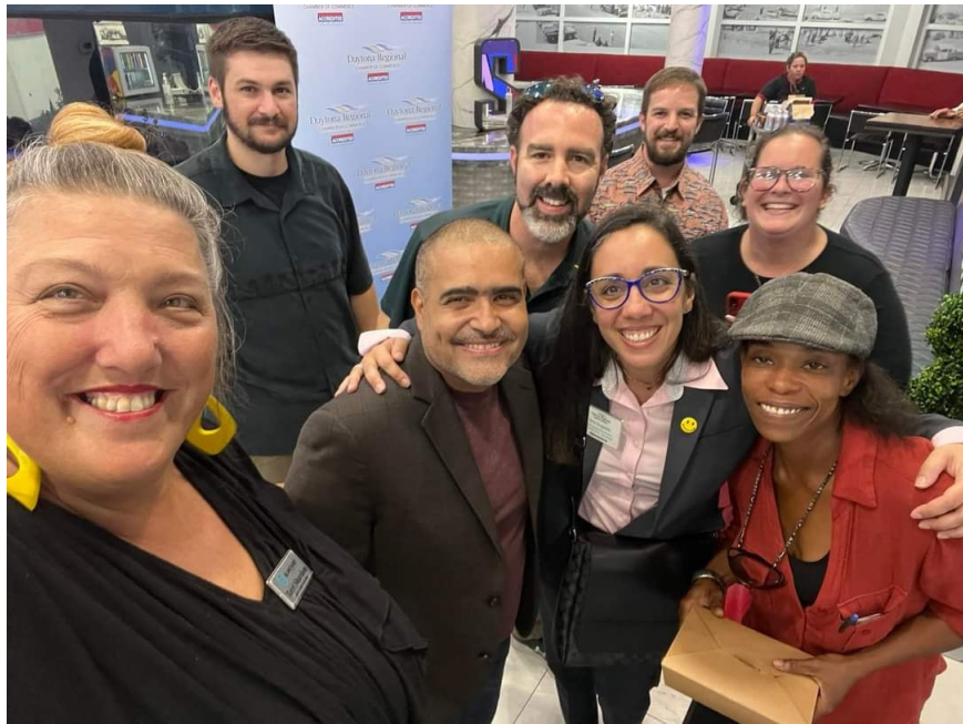
Business After Hours at Streamline Hotel